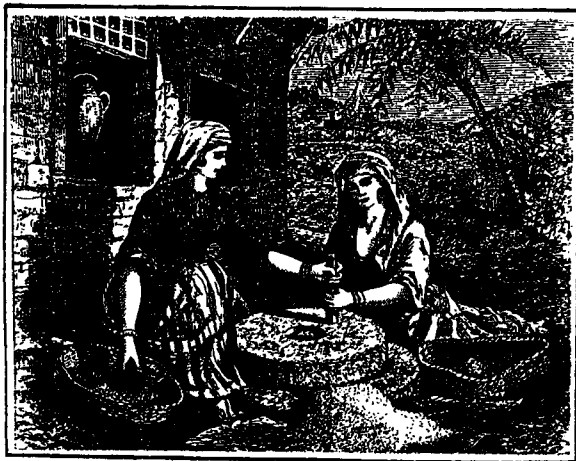
Two Women Grinding at the Mill. Luke 17:30-37.